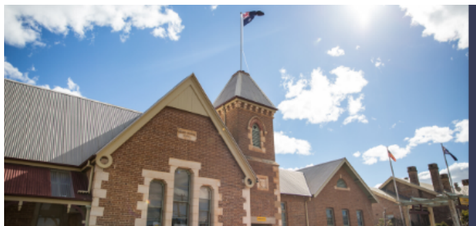
A vibrant and collaborative school community that provides friendship with learning for all students and families

The P&C organises a range of community and fundraising events and operates the canteen and the uniform shops. The profits from all activities help to provide resources and facilities for the school.