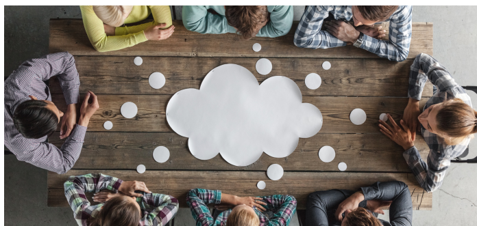
The Mudgee Public School P&C welcomes all new members and values a variety of contributions, ideas and initiatives that support the nurturing and engaging learning environment at Mudgee Public School.