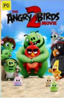
The Angry Birds 2 Movie