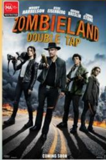
Zombieland: Double Tap