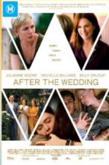
After the Wedding

Visit trybooking.com and search 'Mudgee Town Hall Cinema'.